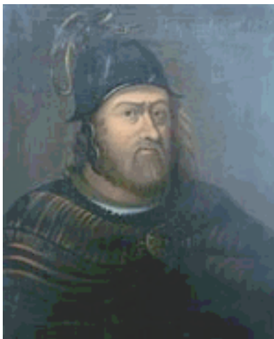
Portrait of Sir William Wallace

William Wallace is Scotland's most beloved son. He initiated the Wars of Independence against England, which, though not able to finish them -- that being left to Robert the Bruce -- provided the impetus that led to Scotland throwing off the English yoke, a circumstance that would persist until the Scottish King James VI (1st of England) assumed the English throne, thus uniting permanently the crowns of the two countries.