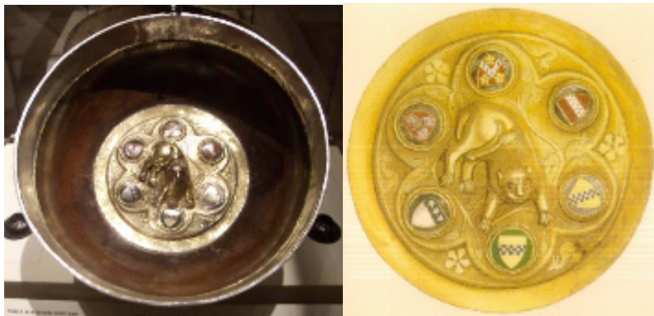
The Bannetyne or Bute Mazer. From left to right - original & copy.