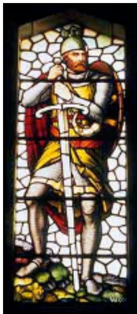
William Wallace -- Stained glass window in Dunfermline Abbey Kirk

In 1304 Edward I occupied Dunfermline Abbey. He burned it when he left. It is generally thought that Margaret was buried there shortly before his arrival. That may have been the reason she was buried outside, providing an anonymous grave safe from a rageful revenge which would likely have ensued had she been buried in the consecrated area inside the church, as would have been expected in more peaceful times.