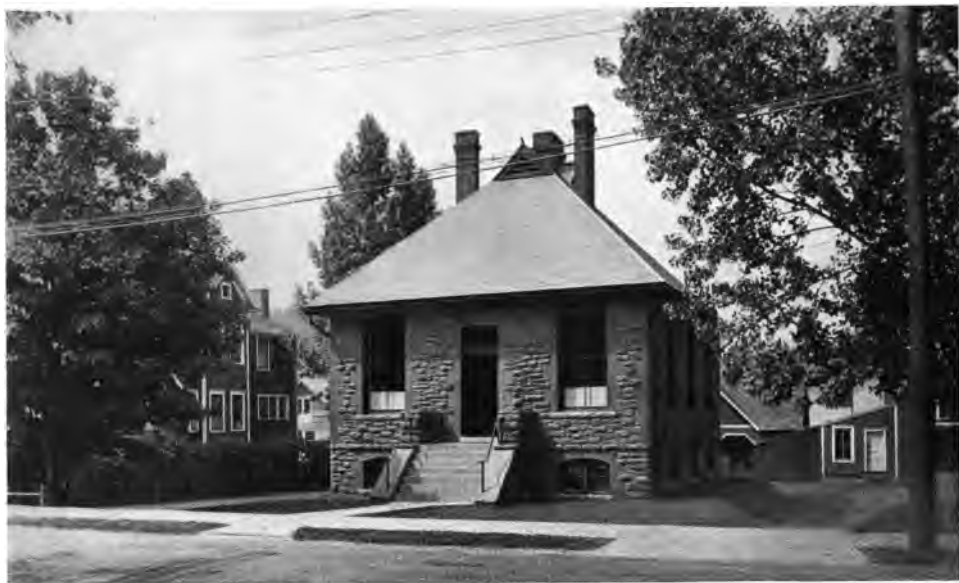
THE SARANAC LAKE LABORATORY