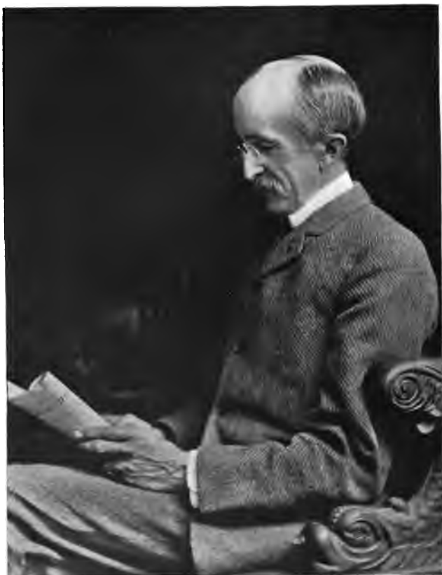
EDWARD LIVINGSTON TRUDEAU