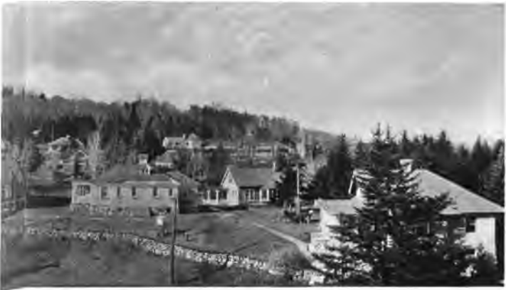
THE ADIRONDACK COTTAGE SANITARIUM