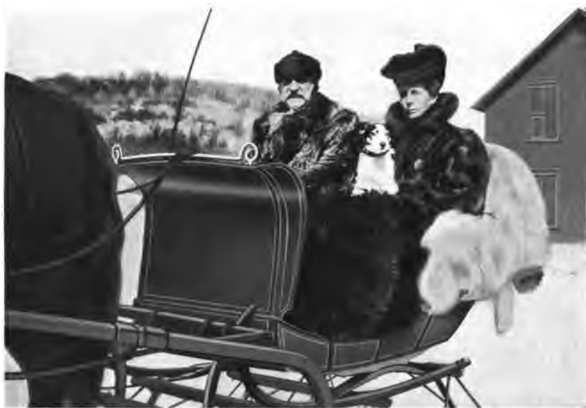
DR. AND MRS. E. L. TRUDEAU