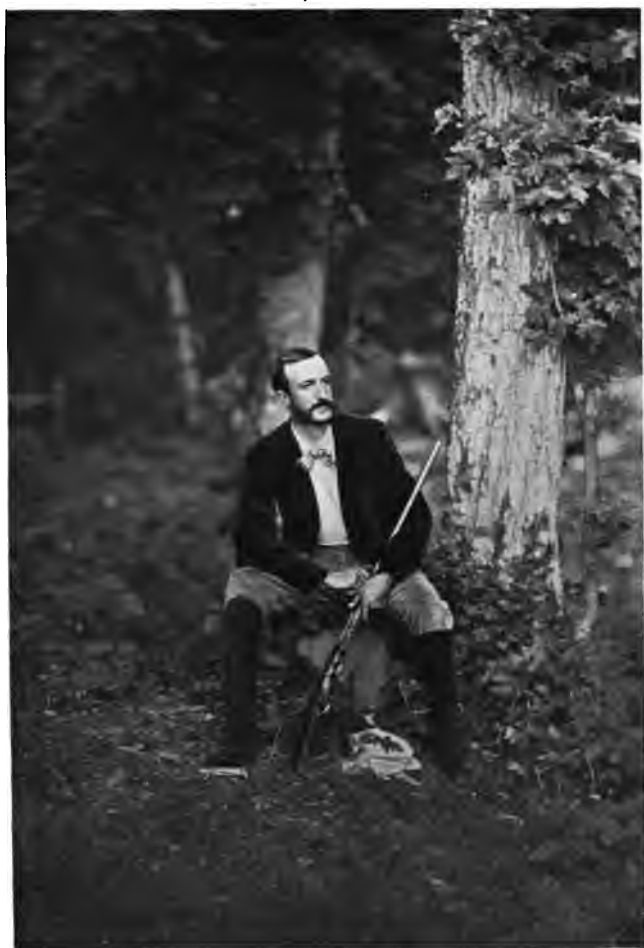
EDWARD LIVINGSTON TRUDEAU