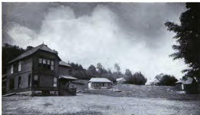
BEGINNINGS OF THE OPEN-AIR CITY OF THE HILLS, ABOUT 1890