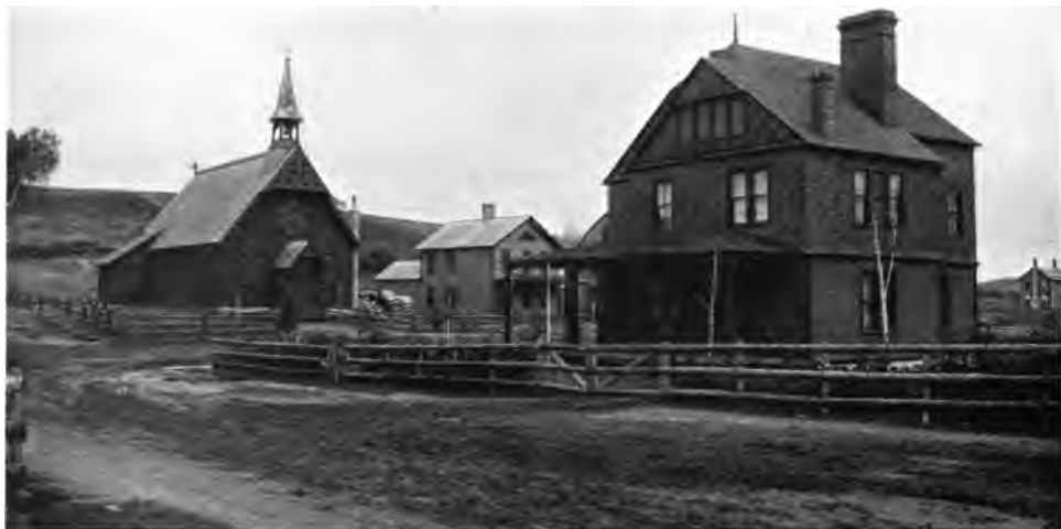
DR. TRUDEAU'S FIRST HOUSE AT SARANAC LAKE (BURNED IN 1893) AND THE CHURCH OF ST. LUKE THE BELOVED PHYSICIAN, FOUNDED BY HIM