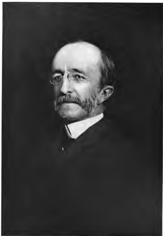
EDWARD LIVINGSTON TRUDEAU