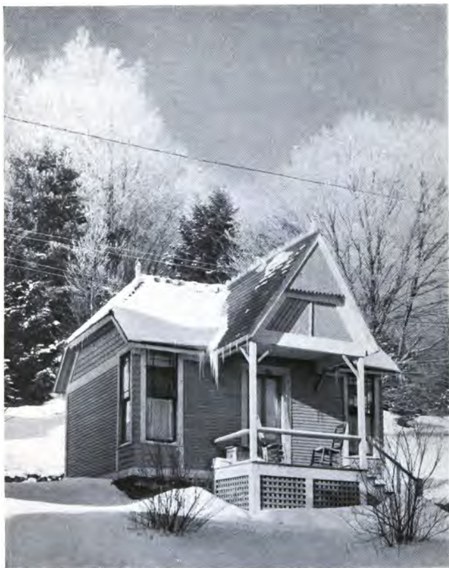
THE "LITTLE RED," BUILT IN 1884 Nucleus of the Adirondack Cottage Sanitarium