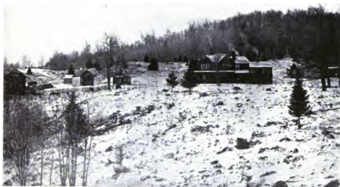
BEGINNINGS OF THE OPEN-AIR CITY, ABOUT 1892 The original "Little Red" to the right of Administration Building