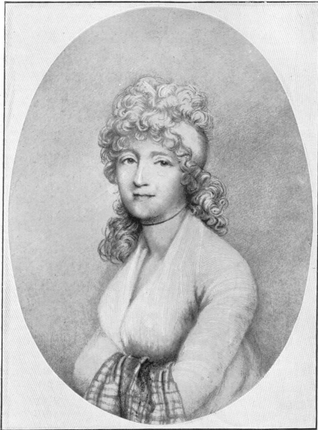
LADY ANNE BARNARD After a Miniature.