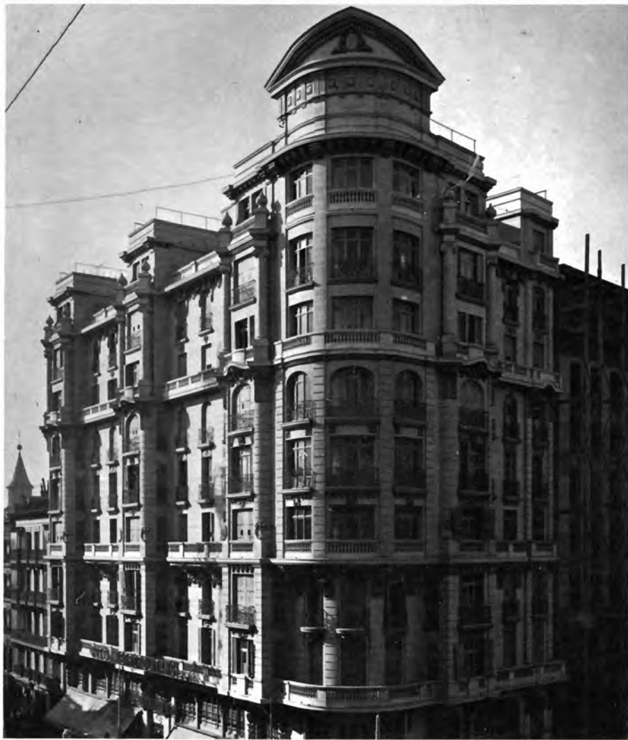
THE COLLEGE PROPERTY AT CANTERAC AND IN MADRID

The estate and "castillo" of Canterac were bought in 1918, with a view to transferring the college there; but, after military occupation, the mansion (top) had to be demolished in 1946.