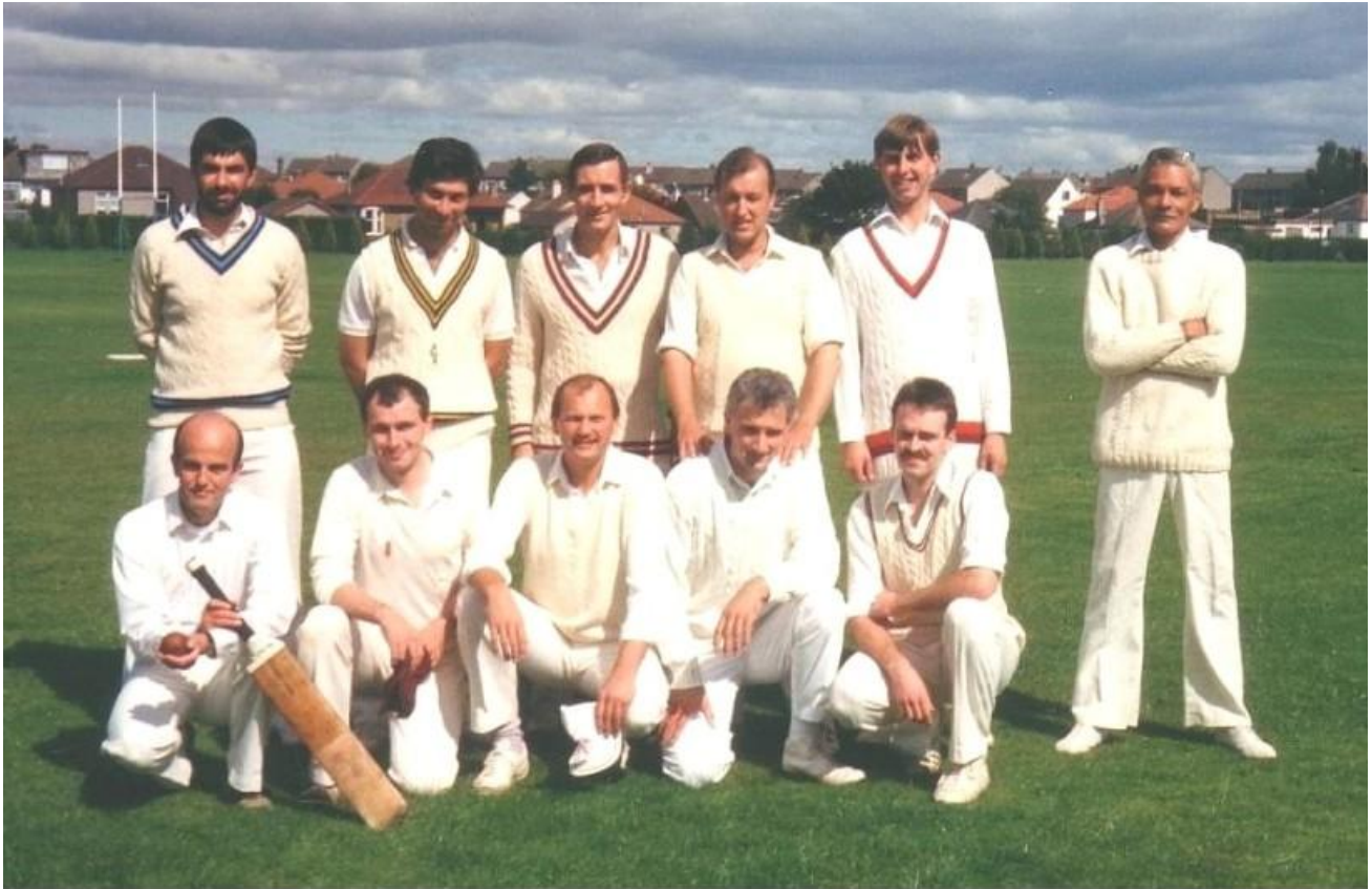
GVCC v Bishopbriggs in August, 1988