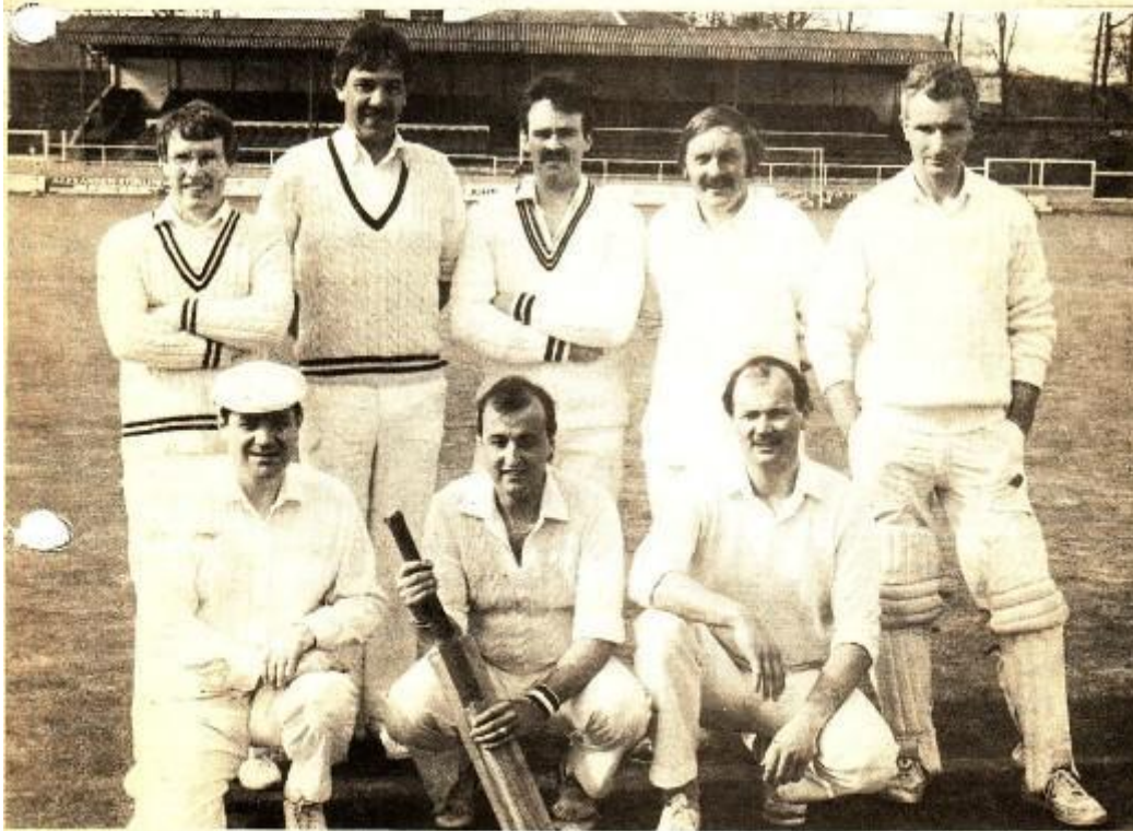
HAPPY MEN . . . the Gargunock team may not have won, but they saw the event their club organised proving a great success.