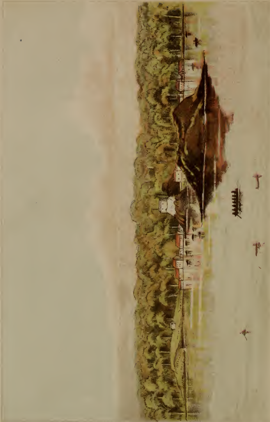
AXIM, FROM THE STEAMER'S ANCHORAGE