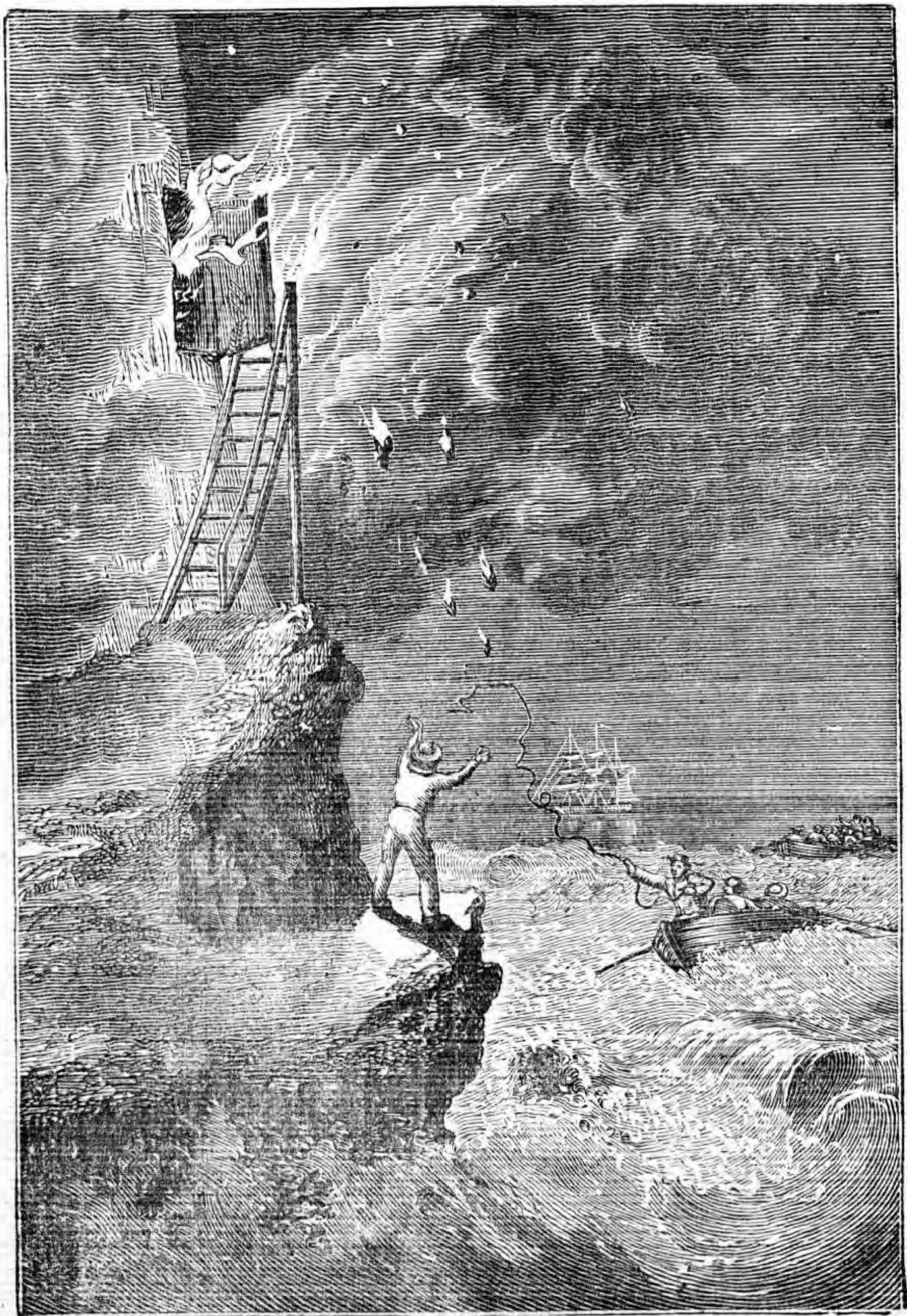
DESTRUCTION OF RUDYARD'S LIGHTHOUSE.