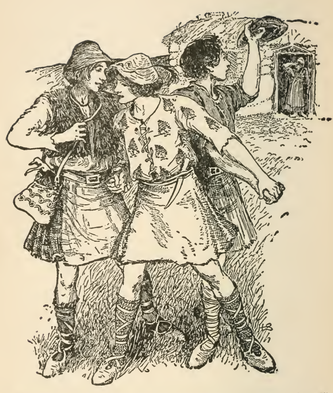
Donald, Dougald and Duncan starting out to seek their fortune.—Page 35. Scottish Fairy Tales.