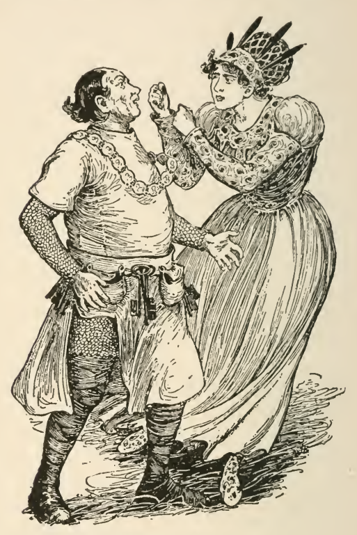
GIVE ME BACK MY JEWELS.

"What? what? My jewels, my shining jewels?" screamed that lady, and, clenching her fists, she ran