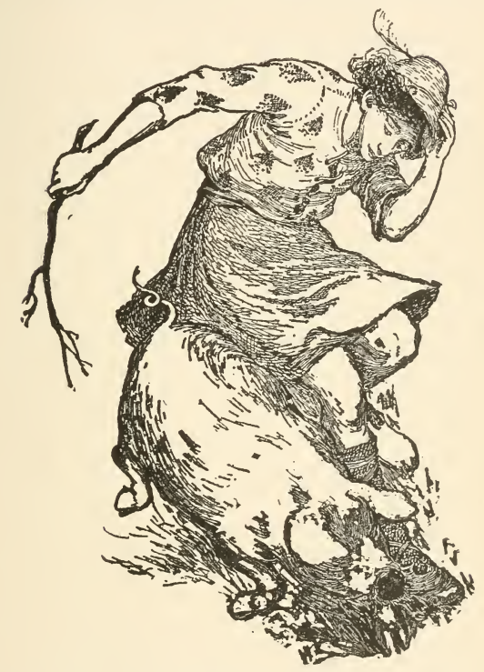
DUNCAN AND THE THUNDER-PIG CAME AS QUICKLY AS THEY COULD.

So Dougald remained in possession of the second