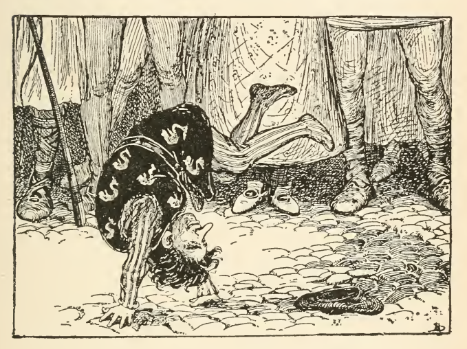
WOULD THROW THREE OR FOUR SOMERSAULTS.

Amongst others the mannikin pproached Gille