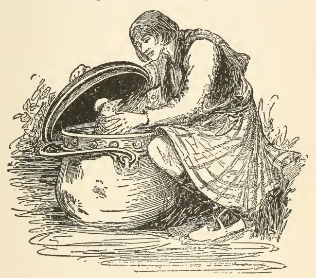
PUT THE FOWL INTO IT INSTEAD.

So the Troll gave him the kale-pot with the cover