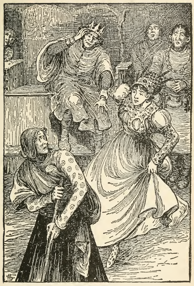
"Come along," cried his wife, seizing the chief by the sleeve and pulling him toward the door.—Page 173. Scottish Fairy Tales.