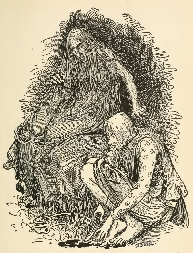
Ian na Piob cut off the little toe from his right foot, and the little toe from his left foot and gave them to the witch to make trolls' broth.—Page 158. Scottish Fairy Tales.