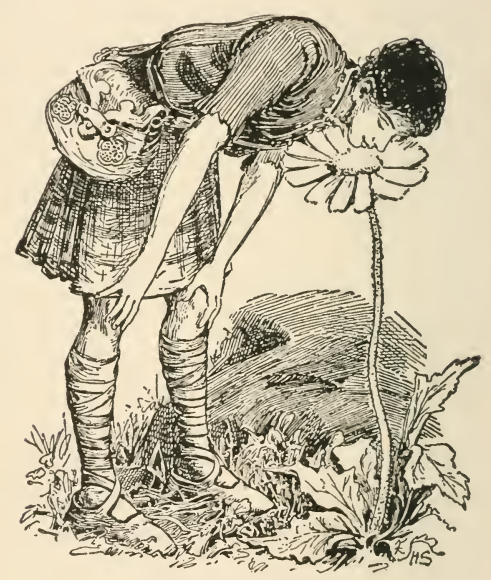
HE LEANED DOWN.

Well, Donald was curious to know what sort of plant a Thunder-flower could be, so he leaned down and gave a truly good sniff in the very centre of the petals.