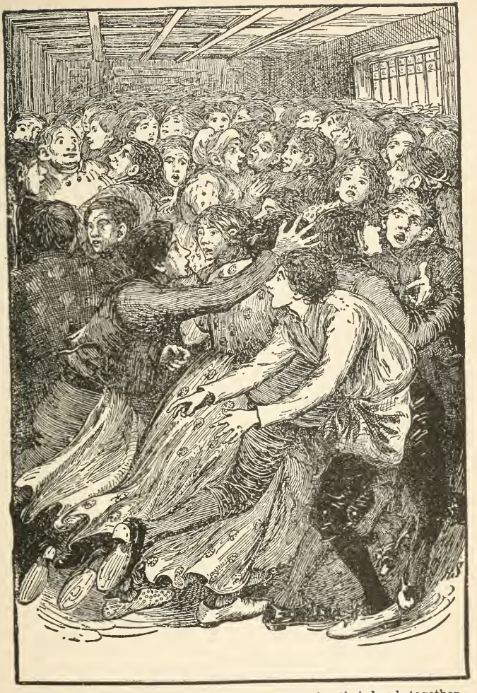
They all ran around, getting very giddy and banging their heads together. Page 101. Scottish Fairy Tales.