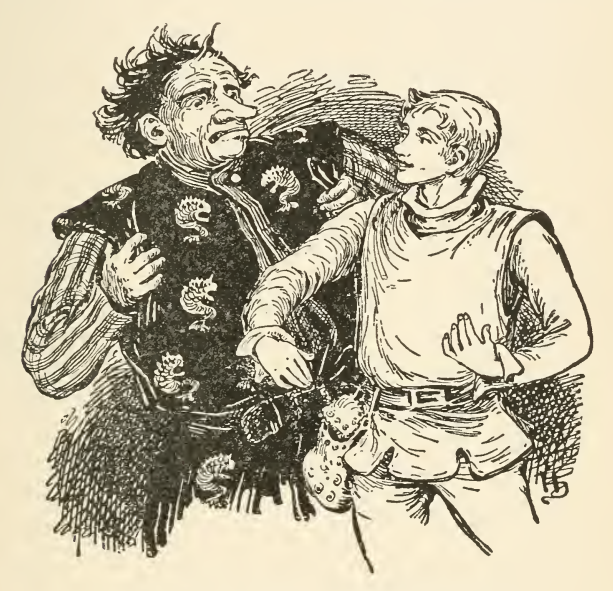
"YOU'LL BE LIKE A BABY BESIDE HIM."

only civil to tell you that whether I go or stay my master will come here after me, as once on the trail of the brazen brogues he never leaves it, so you had better be prepared. Hush! there, don't you hear that?" as a gust of wind swept round the tower;