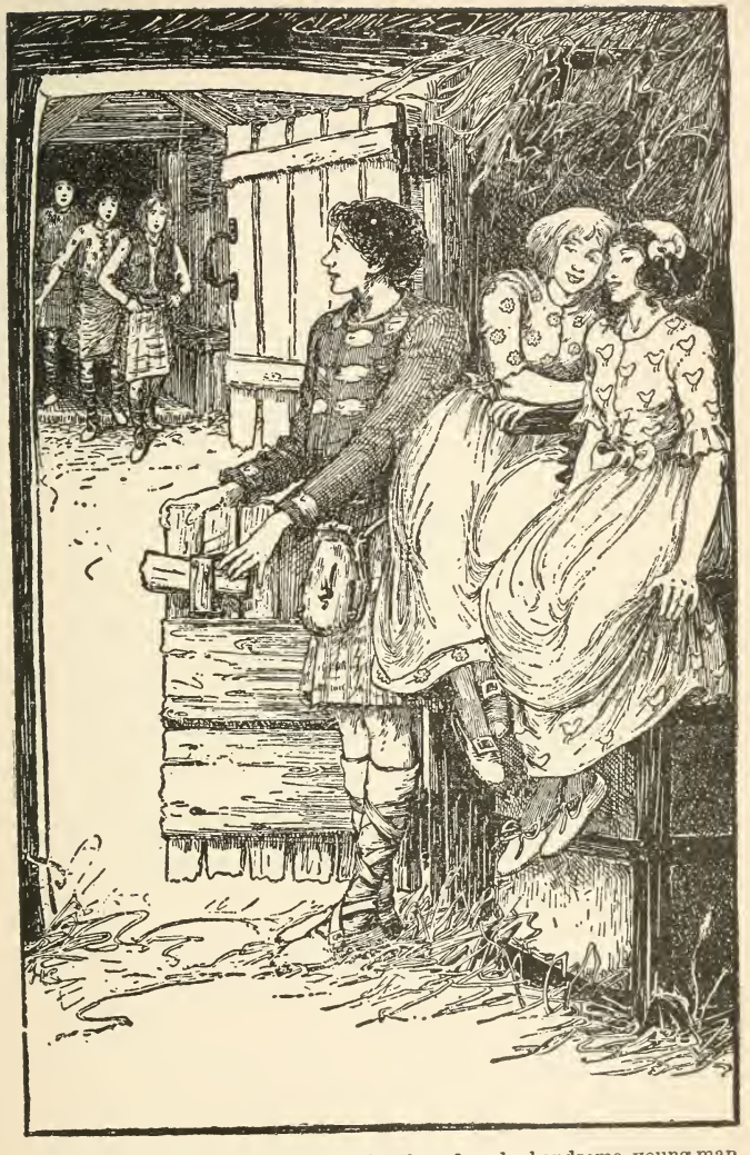
The next morning Duncan and his brothers found a handsome young man standing by the door and two fair maidens seated by him.—Page 64. Scottish Fairy Tales.