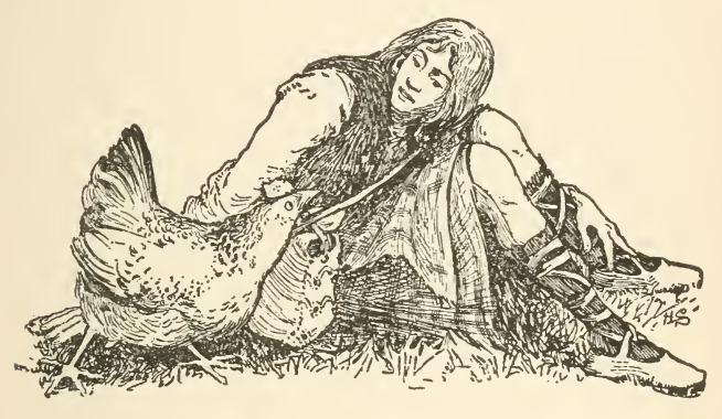
"WHAT DO YOU THINK OF THAT?" SAID THE FOWL.

"Capital," said the fowl; "only, don't cover my head, or you may be startled when you least expect it."