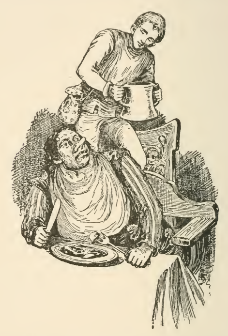
"WHAT ARE YOU DOING?" SAID THE GIANT.

"Oh, ah!" said the giant, a bit taken by surprise. Then, recovering himself, he said, "He must be a