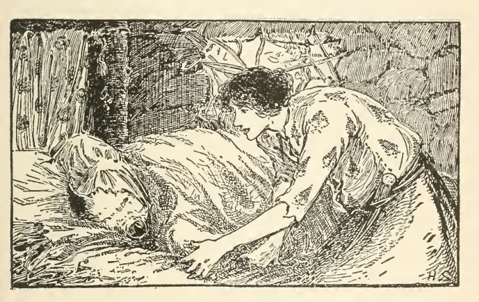
HE TUCKED IT IN.

"Good life!" said the Troll, sitting down with a plump on the hard floor; "you don't say so?"