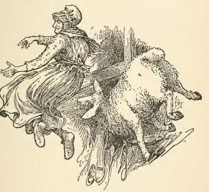
PITCHED INTO THE BED.

"Well, there's no accounting for the ingratitude