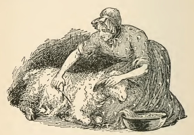
CUT OFF THE RAGGED BITS.

it is fat, for all that, and that's all I want." So she patched up the silly mutton's scars and tears, and cut off the ragged bits of fleece that still hung about him, and washed the bruise where the last auld wife had given such a gruesome kick, and then, having fed the mutton with every good thing she could think of, sat down by the fire and congratulated herself on her good luck.