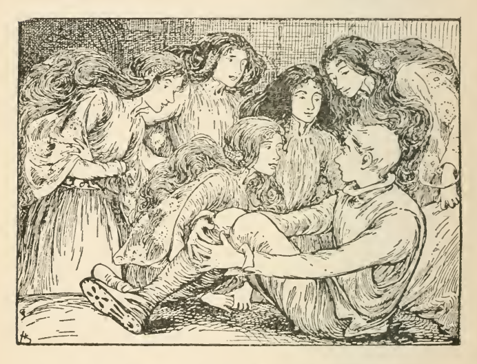
"PUT YOUR QUESTION," THEY SAID.

The next morning the sun shone through the window and woke Gille Macdonald, but not before the green maidens had come down and prepared the breakfast; for they were so pleased at their liberty, their cheats, and contrivances, that whether the sun