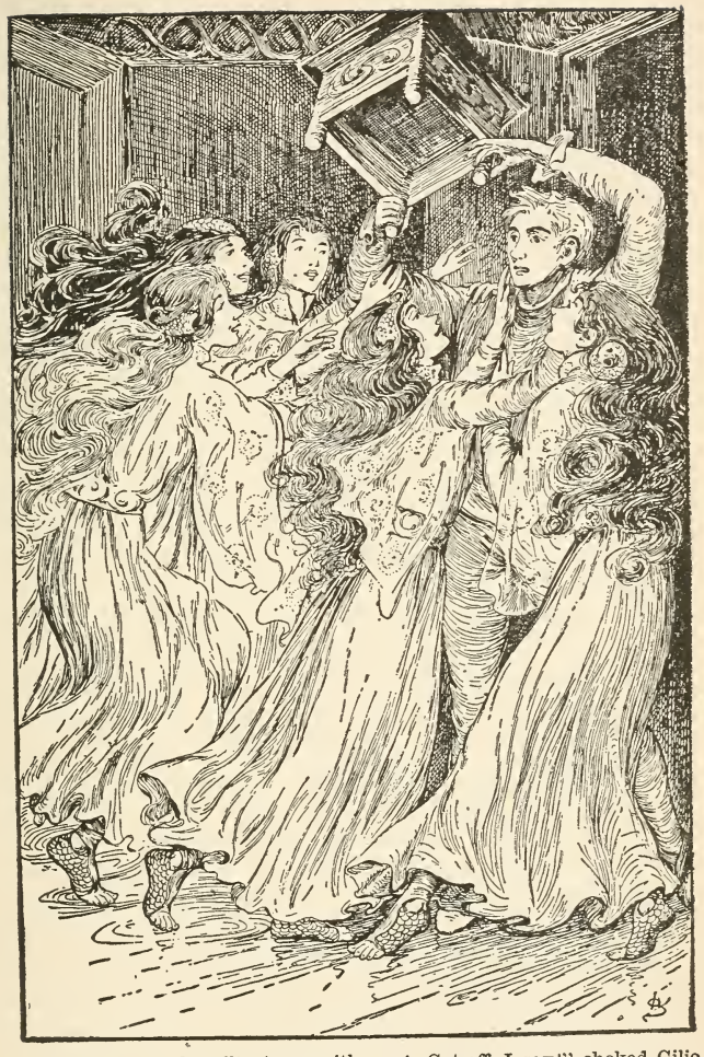
"Have done! be off! Away with you! Get off, I say!" choked Gilie Macdonald, as the maidens hung round about him and embraced him. Page 262. Scottish Fairy Tales.