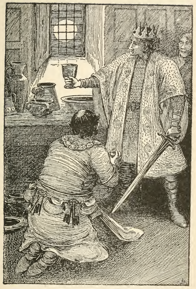
"I beseech you, my lord," said Ian na Sporran, falling on his knees, "taste but a drop of that wine."—Page 166. Scottish Fairy Tales.