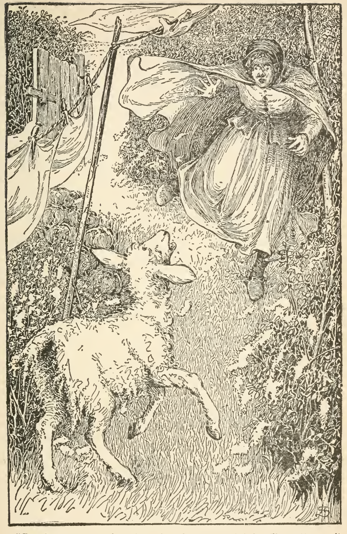
"Baa, baa, baa! see what I have done for you!" cried the silly mutton as it saw the auld wife striding up the pathway toward him.—Page 212.