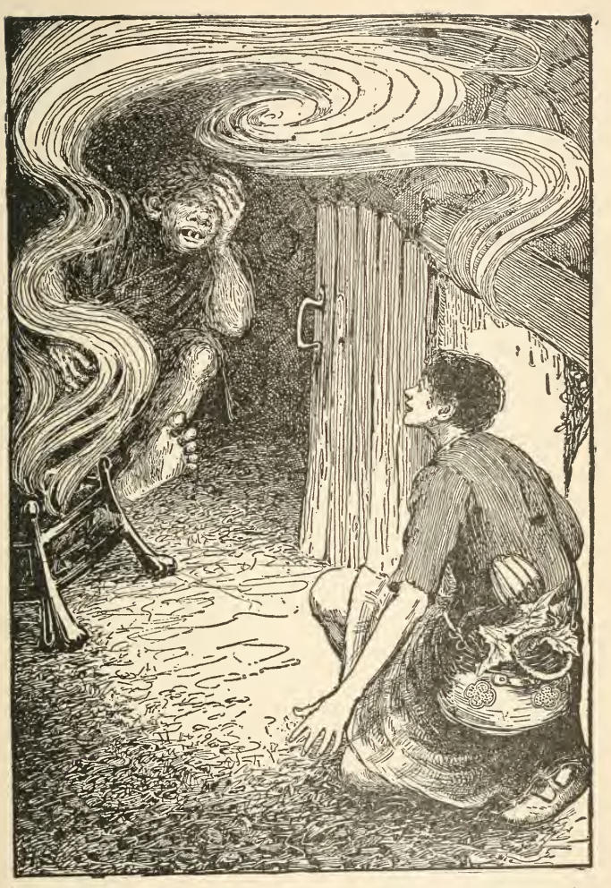
"I am come about a situation," said Donald; "perhaps you may want a servant."—Page 51. Scottish Fairy Tales.