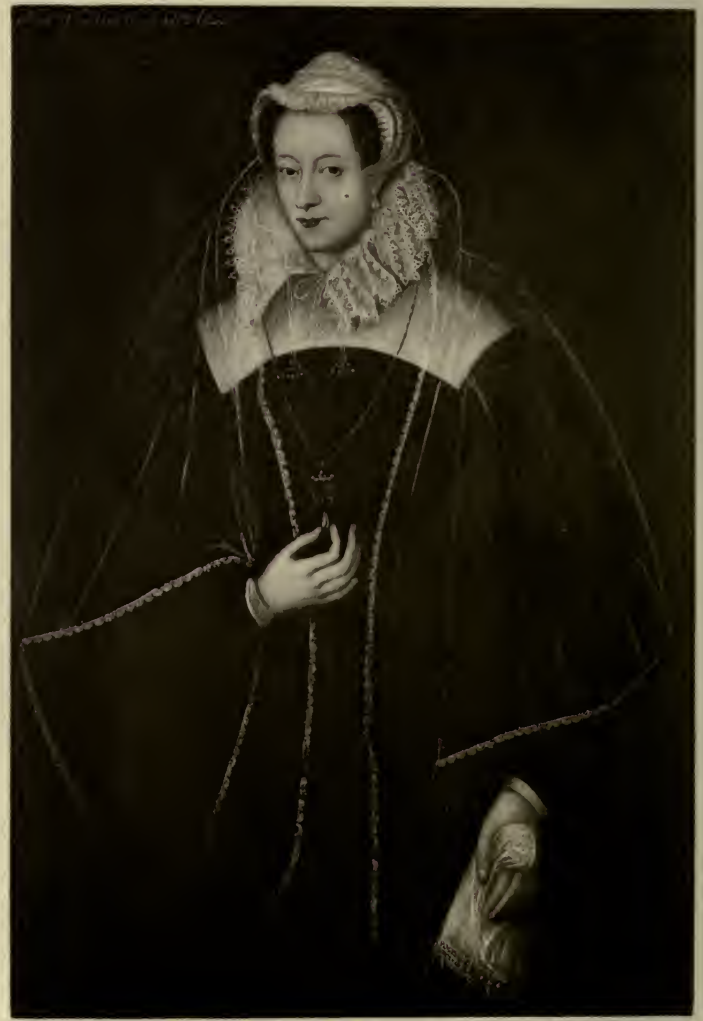
Mary Queen of Scots (The "Morton" Portrait)