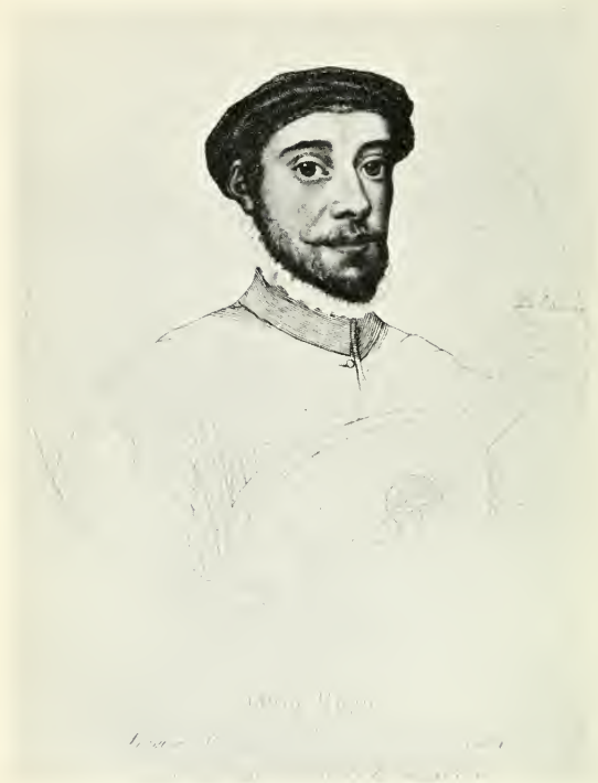
DAVID RIZZIO (From Lord Ruthven's "Relation")