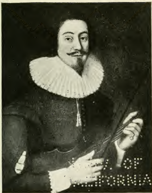
DAVID RIZZIO (Lord Seaforth's Portrait)