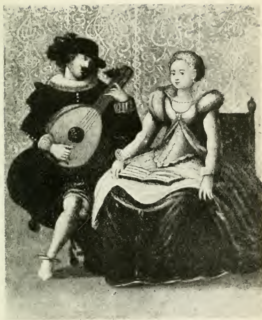
QUEEN MARY AND HER SINGER (The Smeaton-Hepburn Picture)