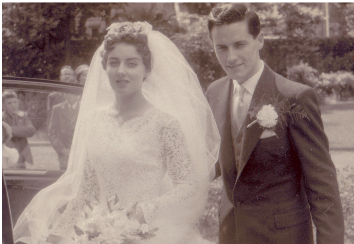
August 16, 1958, Plymouth, England