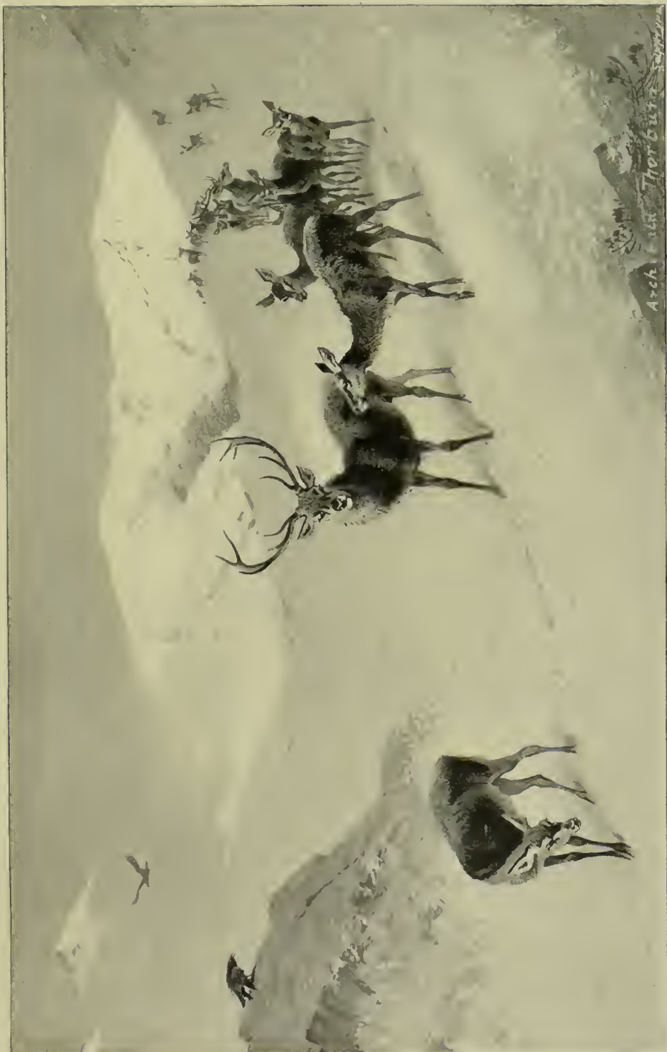
DRIVEN OFF THE HILL