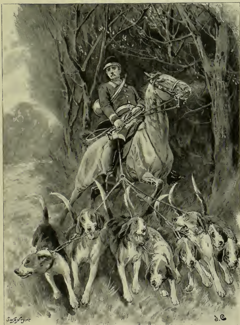
RATHER A HANDFUL