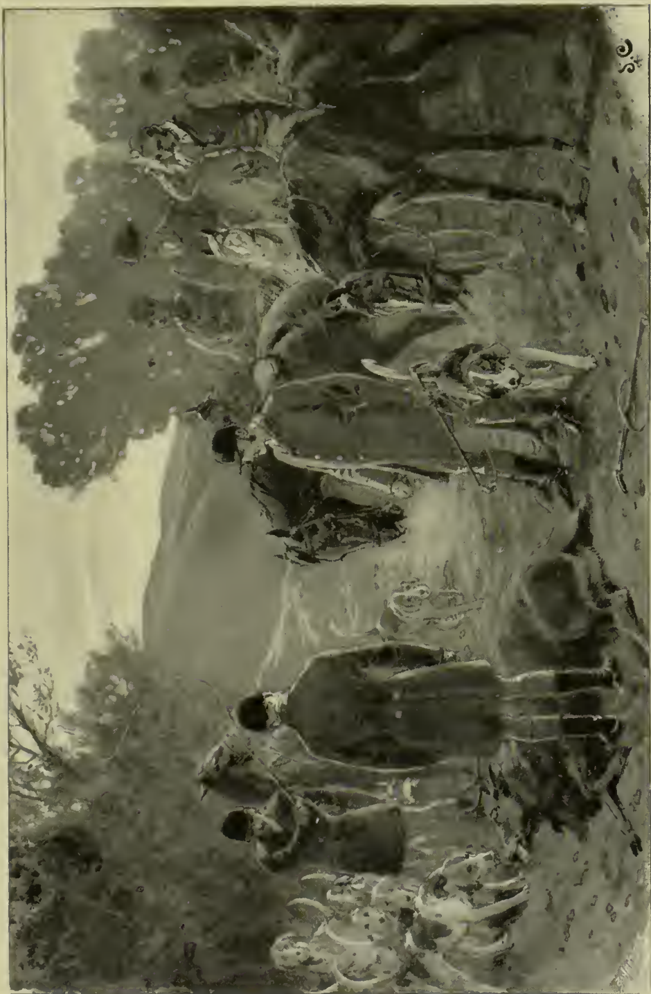
KILLED AFTER RUNNING THROUGH TWELVE DIFFERENT PARISHES