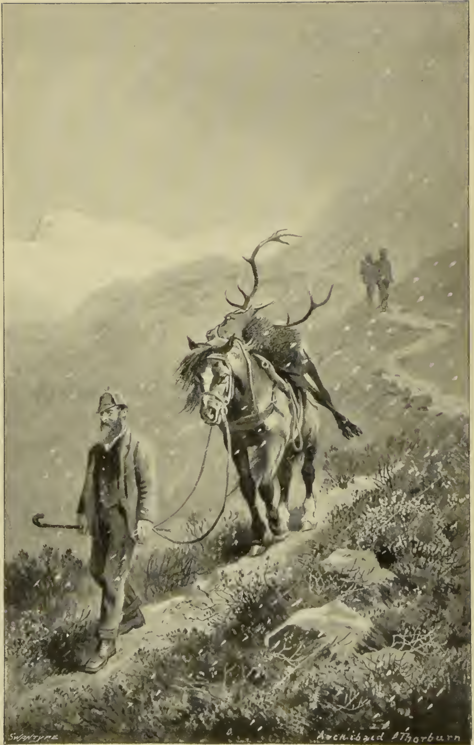
THE LAST STAG OF THE SEASON