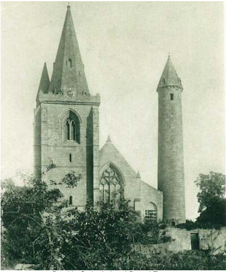
Brechin Cathedral and Round Tower