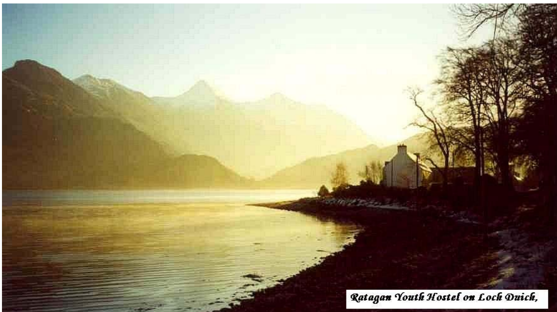
Ratagan Youth Hostel on Loch Duich,

As you can see from this photograph of a gloaming at Ratagan,