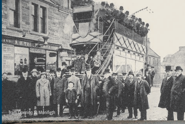
Tram Opening at Monifieth