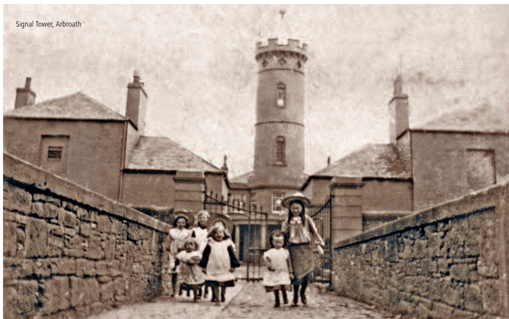
Signal Tower, Arbroath