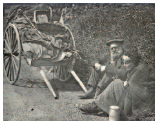
Forfar Burgh Police 1900-1904 (top) Travelling couple