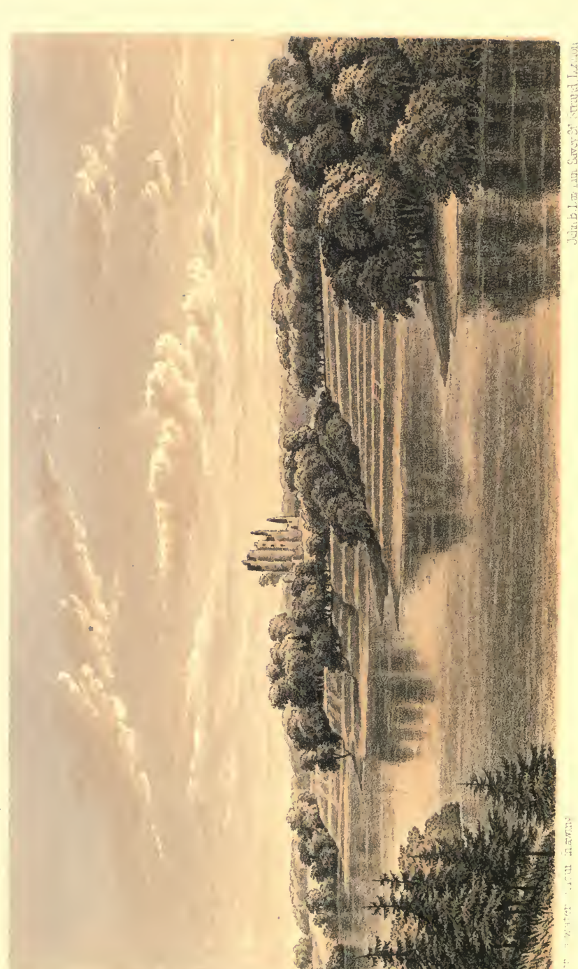
NSHIKE CASTLE KENNELY