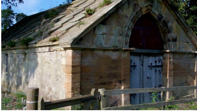
The chapel at Herdmanston.

Inside the chapel are many white marble plaques mounted on the walls, each with its own inscription marking a family member's passing. On the ground are two more grave markers. These two are obviously the oldest in the building. I recall reading they're from the 1500s. One has the engrailed cross on it; the other shows 3 roosters around a crescent moon.