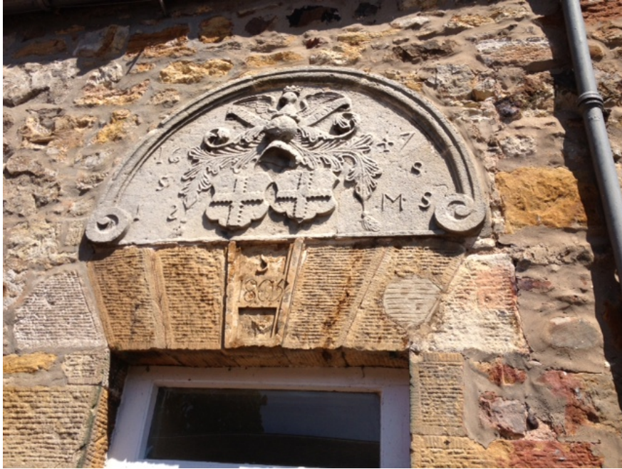
Above is a picture of the portico above the farm's back door taken from the original manor house.